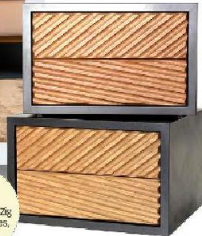
6 Ben Wehrlich Zig Bedside Tables, ORVI.