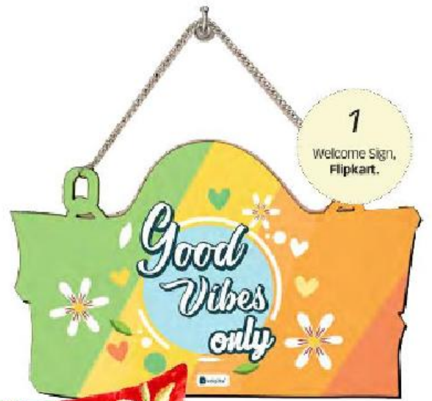
1 Welcome Sign, Flipkart.