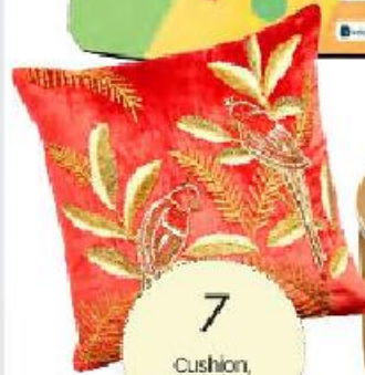
7 Cushion, Helmars.