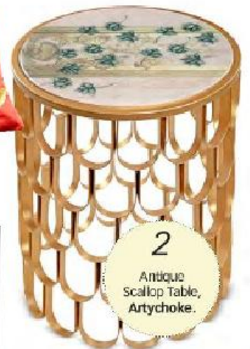
2 Antique Scalloped Table, Artychoke.